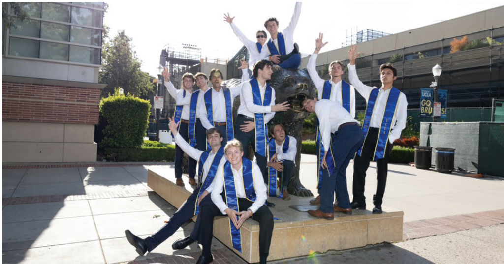
Some of our 2025 seniors celebrate after graduation.